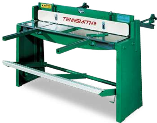
TENNSMITH 52" Foot Shear • 52" x 16 Ga. mild steel foot shear